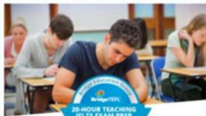
Teaching IELTS Exam Prep 20-Hour TEFL/TESOL Micro-credential