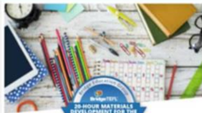
Materials Development for the EFL Classroom 20-Hour TEFL/TESOL