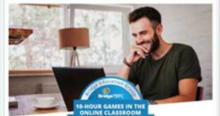
Games and Activities for the Online Classroom (Adults)