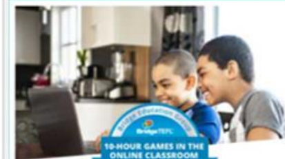
Games and Activities for the Online Classroom (Young Learners)