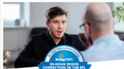
Error Correction in the EFL Classroom 20-Hour TEFL/TESOL